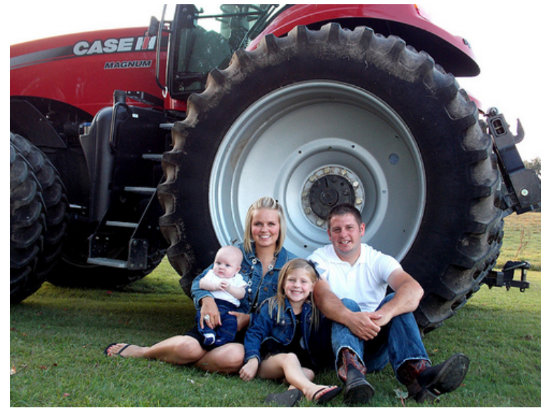
Gaskins Family- 2013 Outstanding KY Young Farm Family Finalist