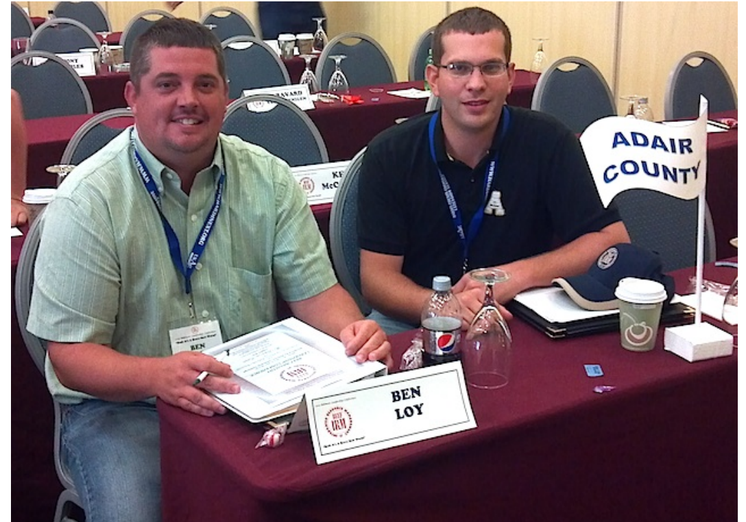
2012 Beef IRM Leadership Tour