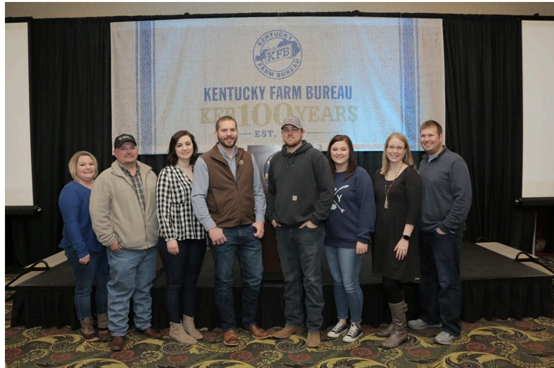
2019 KFB Young Farmer Leadership Conference