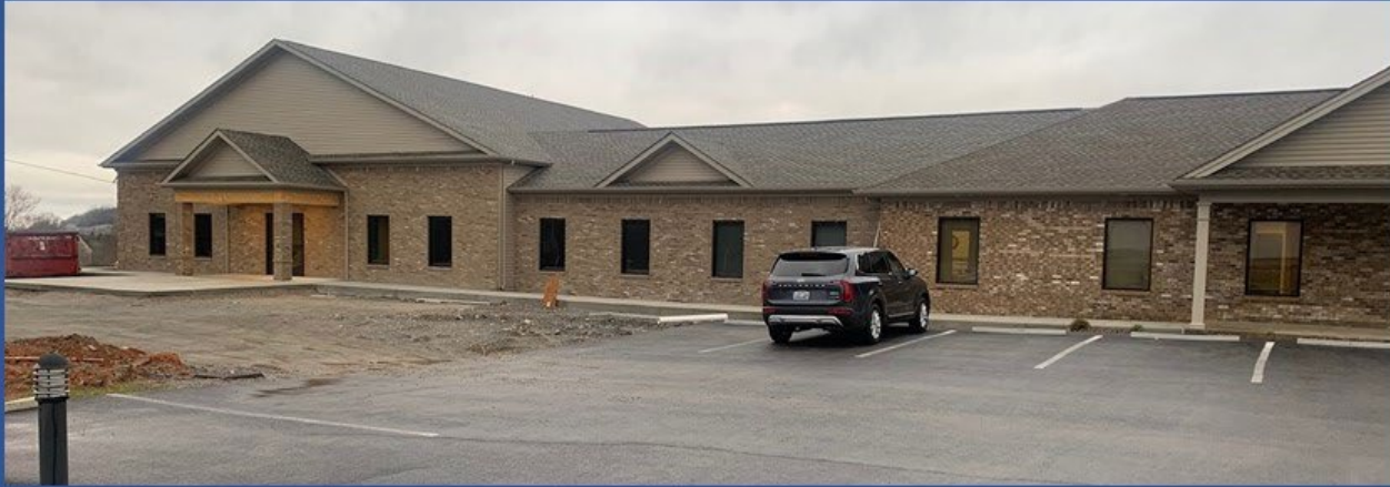
Clinton County—March 2020